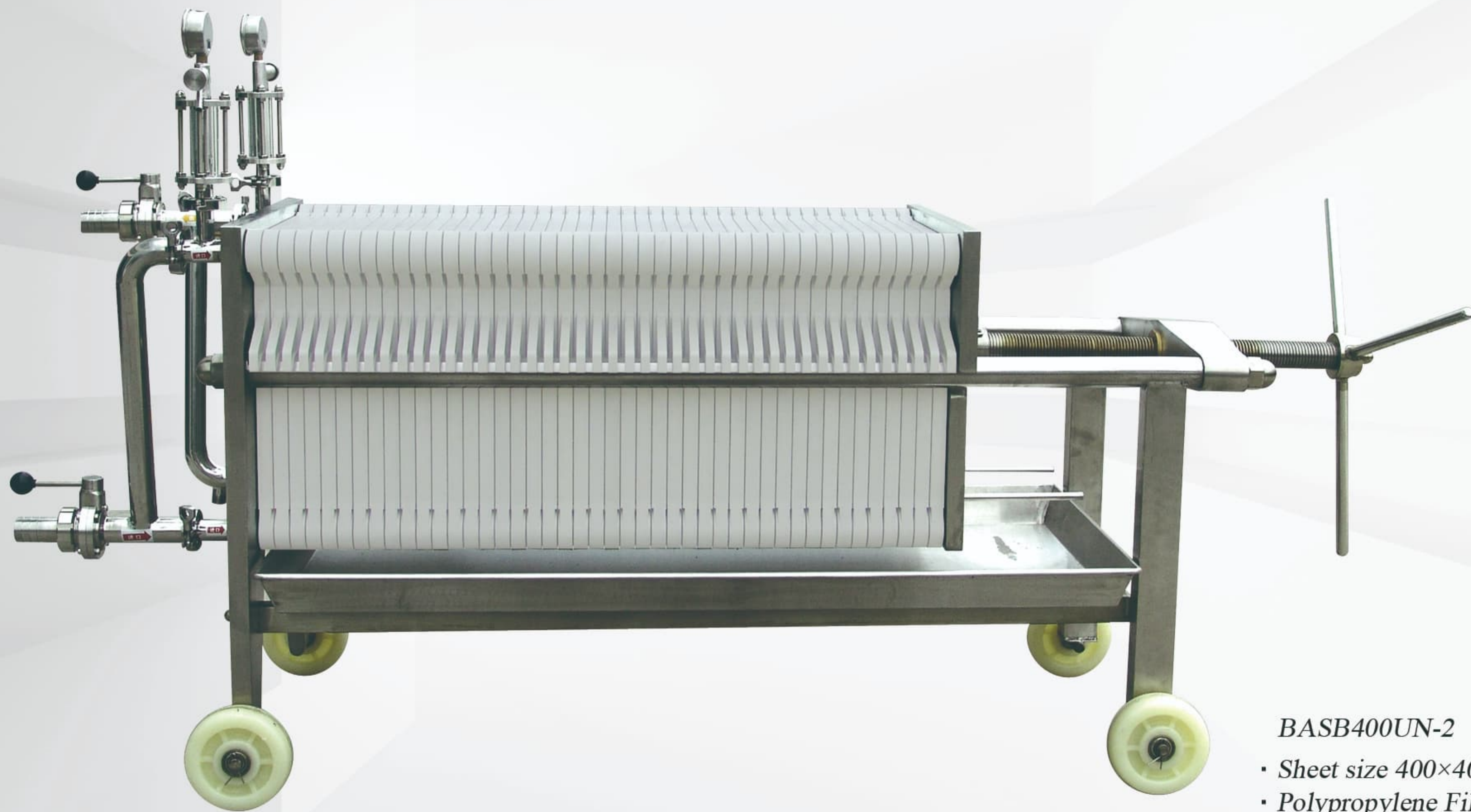
BASB400UN-2 • Sheet size 400×400 mm • Polypropylene Filter plates • Manual screw closing